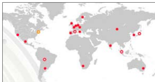
SolidWorks Corporate Offices